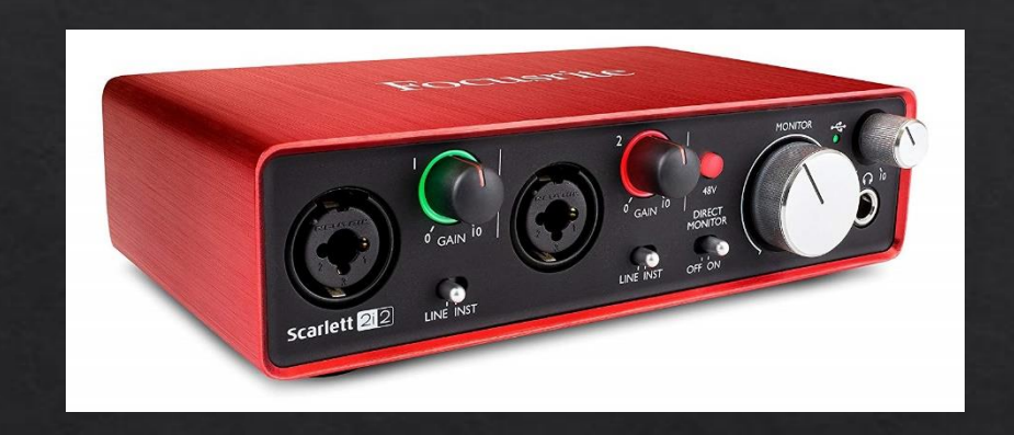
Focusrite Scarlett 2i2